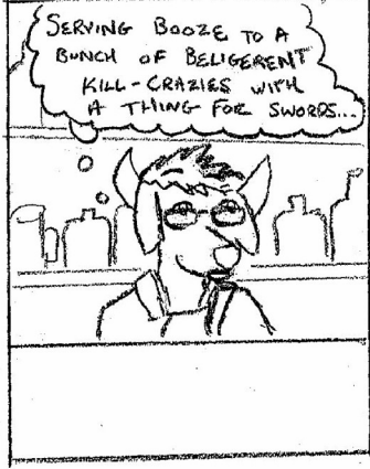
"Dungeon Buddies" #2